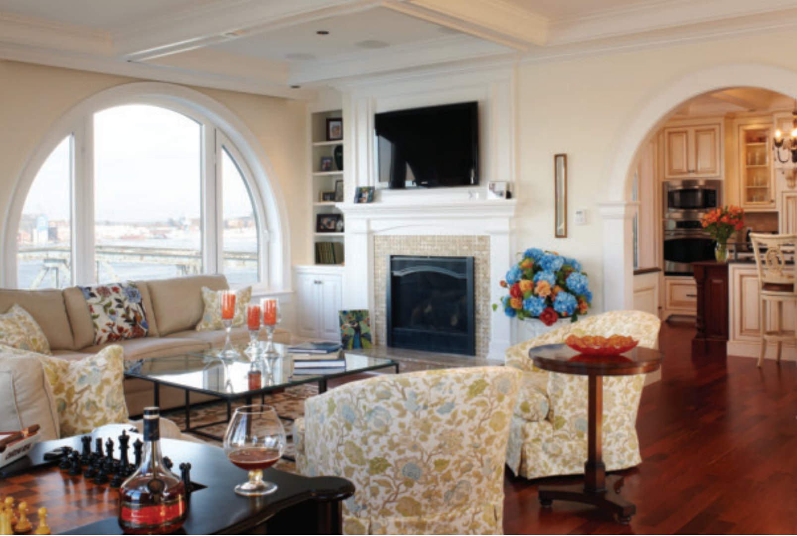
Above: Stunning arched windows give the living room dramatic views from every angle. Renée primarily used a neutral palette, but brought in the colors of the earth, sea and sky with key accent pieces. | Right: The kitchen has a Tuscan feel, with its graceful stone arch behind the stove and grape accents. Note the unique island with its raised top of smoked glass. | Below: an exterior view of Harbour Place and the swift-flowing Piscataqua river. Facing page, above: The entry hallway does double-duty as a gallery, featuring paintings the Plummers have collected over the years. Below: Off to one side of the hallway, Dan's office is both a relaxing haven and a workspace. The handsome desk is handcrafted of Cuban mahogany and features inlays of ebony.